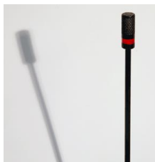
TMD01 version 05.1209.32