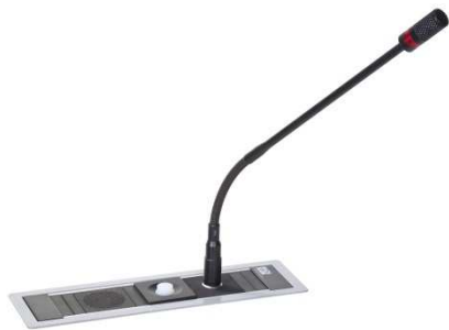
Application example Power Frame silver-grey

No audio playback instead of headphone jack. Article no.: 05.1211.32