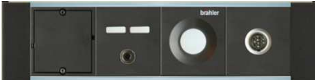
Application example with headphone connection

Article no.: 05.1211.32/05.1211.32.CH – 05.1212.32/05.1212.32.CH – 05.1213.32/05.1213.32.CH