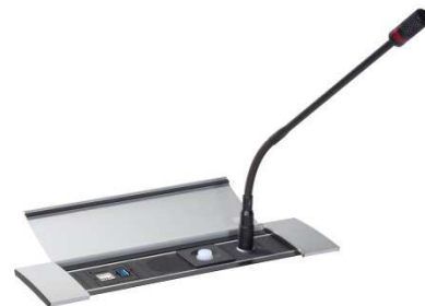
Application example Power Frame Cover Aluminum

The following inserts are available for the custom chassis: